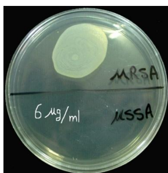
Figure 1. The growth of S. aureus , susceptible (Down) and resistant (Up) to methicillin, on Mueller-Hinton agar containing 6 µg/ml of oxacillin