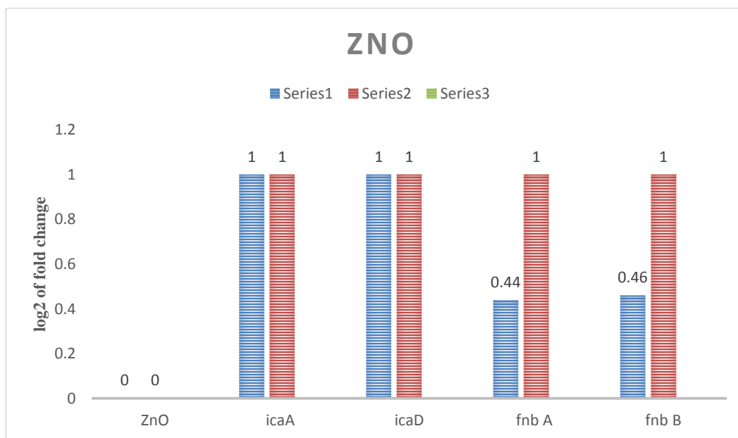
Figure 3. The expression profiles of biofilm-associated genes in S. aureus in Sub-MIC concentration of ZnO nanoparticles ( P < 0.05 ).