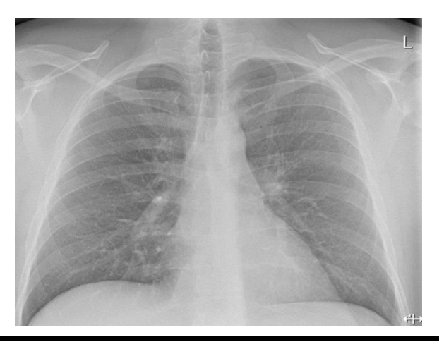
Figure 2 . Chest X-ray of the patient, No specific Symptoms were seen

The chest X-ray has been normal (Fig2). Patient echocardiography had no evidence of cardiac failure or endocarditis. Contrastive brain MRI for the patient, with the rejection of cerebrovascular problems, indicated the multi-focal areas with circular border view and cerebral edema (Fig1). The cerebrospinal fluid was prepared and sent to the laboratory for analysis and culture and the following results were obtained (Table 2).